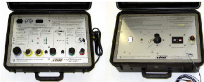
DPD Electrical Diagnostic Bench Test Kit is included with DPD Long Term Maintenance Special Tools.

Includes all special tools required to perform depot level maintenance for up to six (6) STD/DPDs. (NSN 4220-01-536-1448)