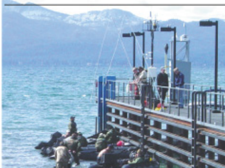
STIDD Systems provides worldwide on-site training

Provides for the coding, identification and marking of STD/DPD and selected options in compliance with MIL STD 130.